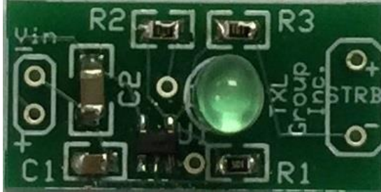
Figure 1 – The VBStrobe

The VBStrobe charge storage board accumulates charge from an external source and then releases the stored energy in bursts through a strobed high brightness LED. The unit is hardware programmed to have a nominal 1 Hz frequency with a 50% duty but this is dependent upon the voltage and internal impedance of the source. By changing onboard resistors and capacitors, a user can tailor the circuit for targeted applications.